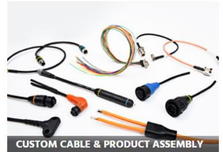
CUSTOM CABLE & PRODUCT ASSEMBLY