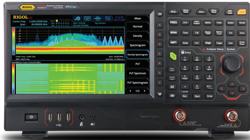
Rigol RSA5000 Real-Time Spectrum Analysers